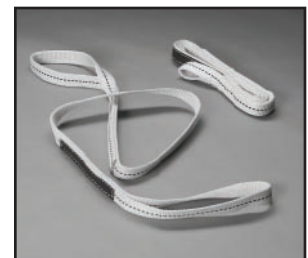
Nylon Sling Accessory Model 8510 Series