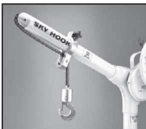
Choker Collar Accessory Model 8507