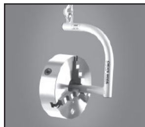
Chuck Hook Accessory Model 8520