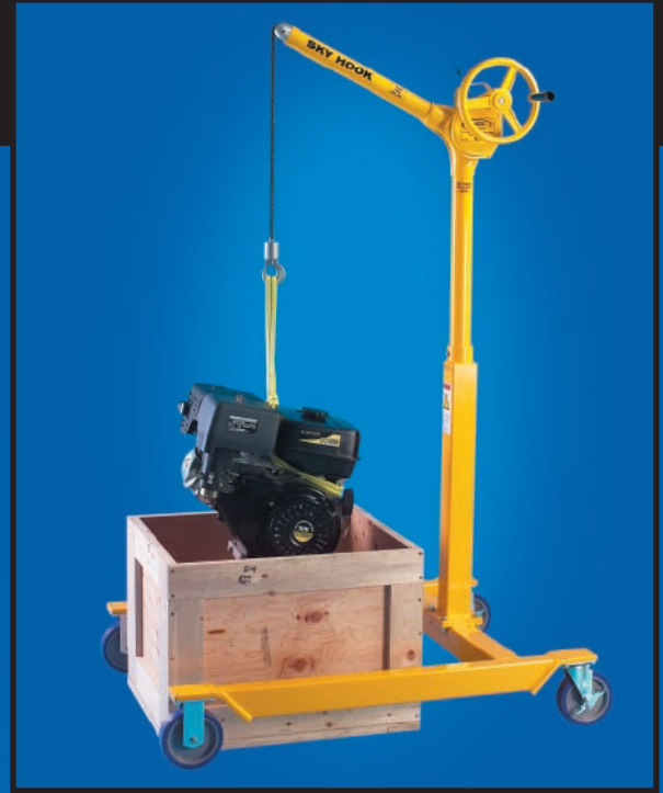
Accessory 8510 Series Nylon Sling shown above (Sold separately)